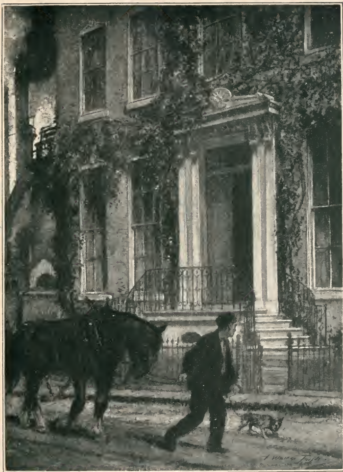
IN SPITE OF SUCH SURROUNDINGS THE BIG HOUSE WAS IMPRESSIVE